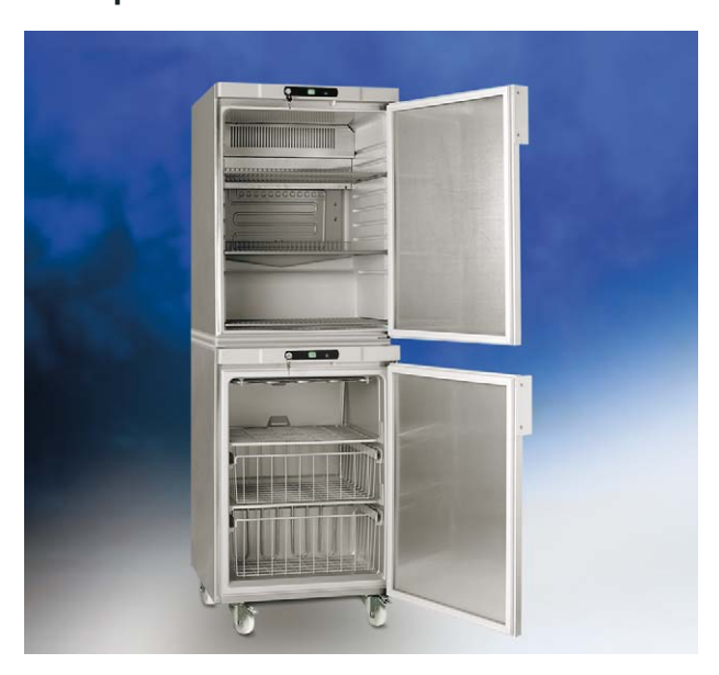
Refrigerators and freezers have the same outside dimensions and are thus easily combined. The combination shown: F 200 R and K 200 R with 134-litre freezer and 166-litre refrigerator. Dimensions: 59.5 \times 62 \times 174 \text{ cm} (W x D x H).