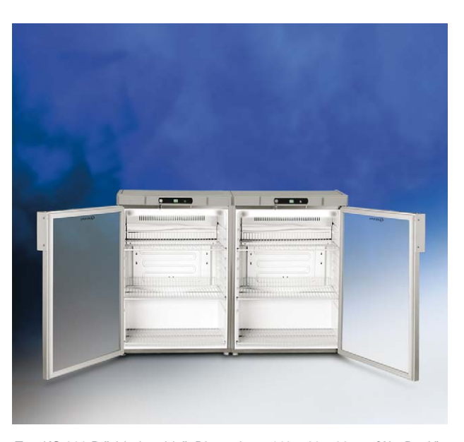
Two KG 200 R "side-by-side". Dimensions: 119 \times 62 \times 83 \text{ cm} (W x D x H).