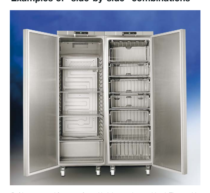
Refrigerators and freezers of equal heights can be combined. The combinations shown are: K 400 R and F 400 R with 387-litre refrigerator and 332-litre freezer. Dimensions: 119 x 62 x 178 cm (W x D x H).