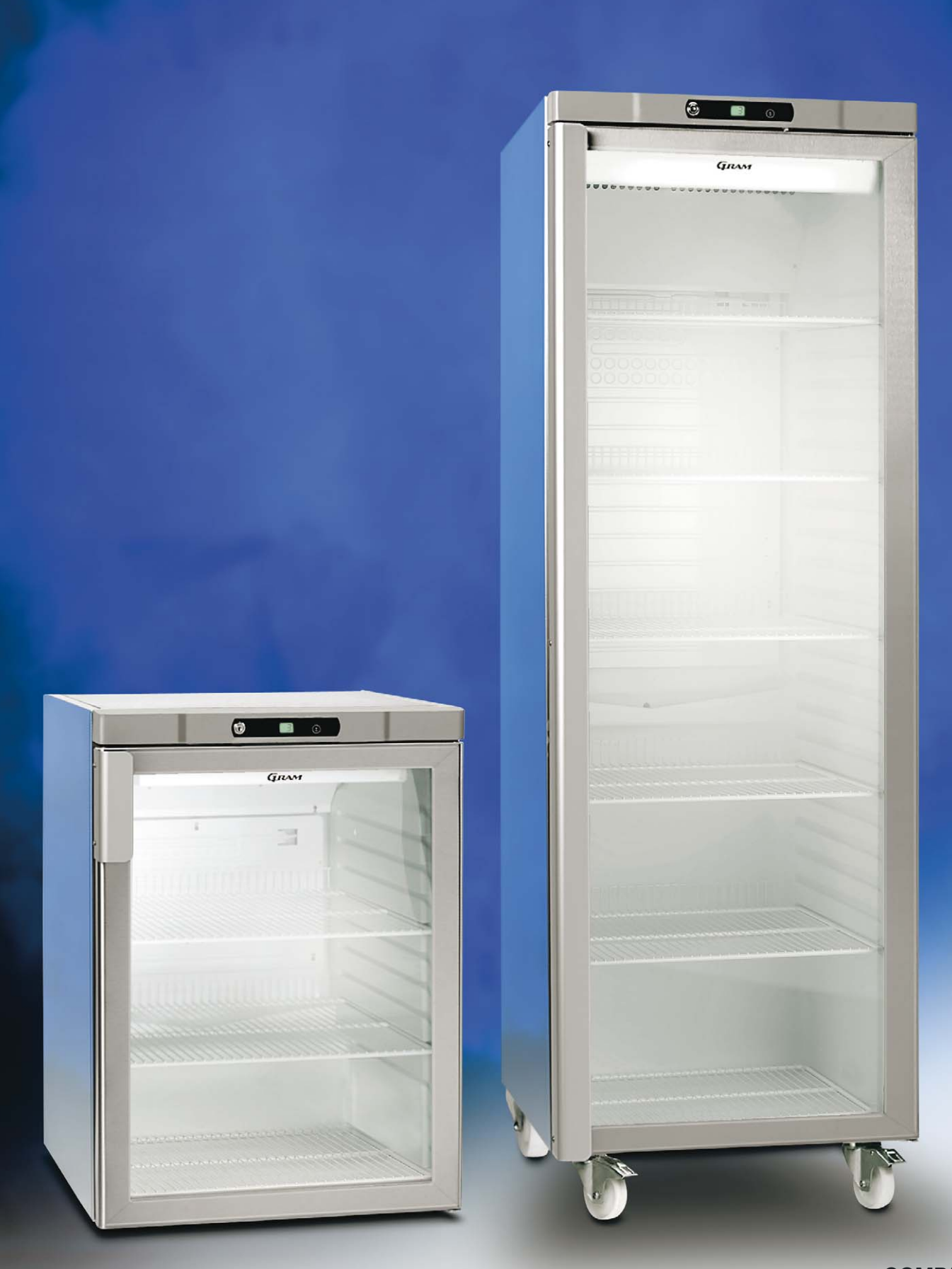
COMPACT KG 200/400 R