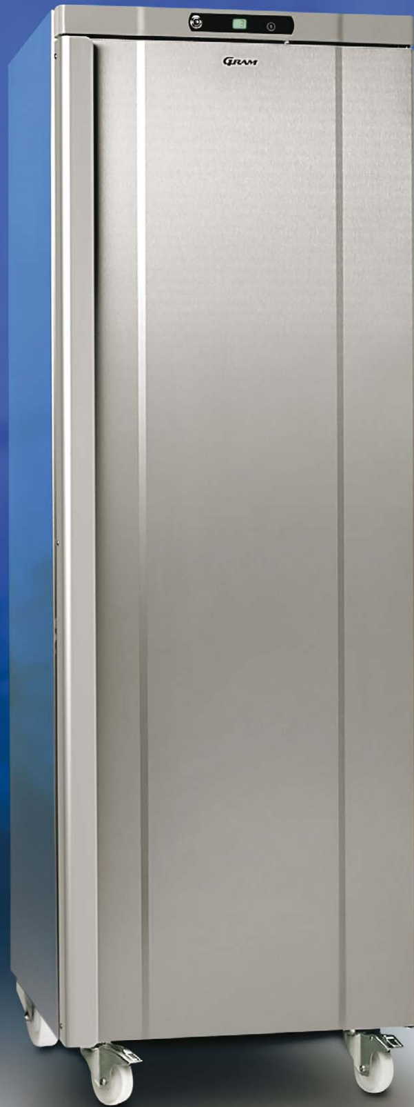
COMPACT 400 R