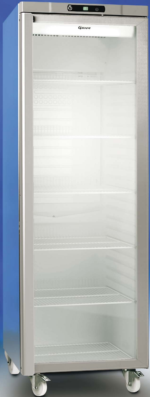
COMPACT KG 200/400 R