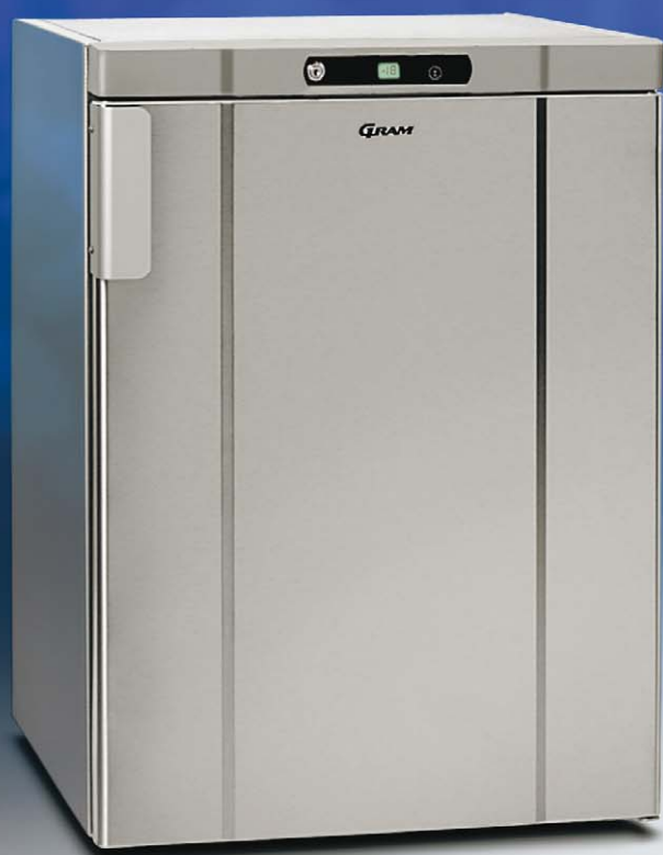
COMPACT 200 R