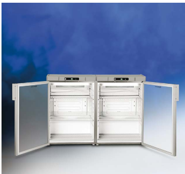
Two KG 200 R "side-by-side". Dimensions: 119 x 62 x 83 cm (W x D x H).