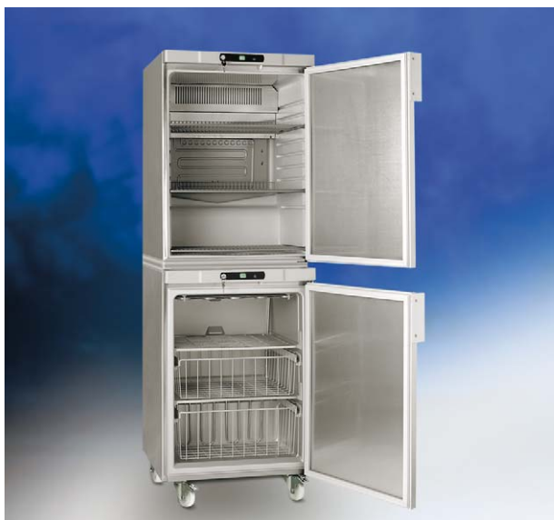
Refrigerators and freezers have the same outside dimensions and are thus easily combined. The combination shown: F 200 R and K 200 R with 134-litre freezer and 166-litre refrigerator. Dimensions: 59.5 x 62 x 174 cm (W x D x H).