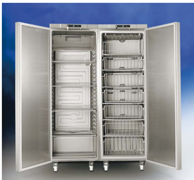
Refrigerators and freezers of equal heights can be combined. The combinations shown are: K 400 R and F 400 R with 387-litre refrigerator and 332-litre freezer. Dimensions: 119 x 62 x 178 cm (W x D x H).