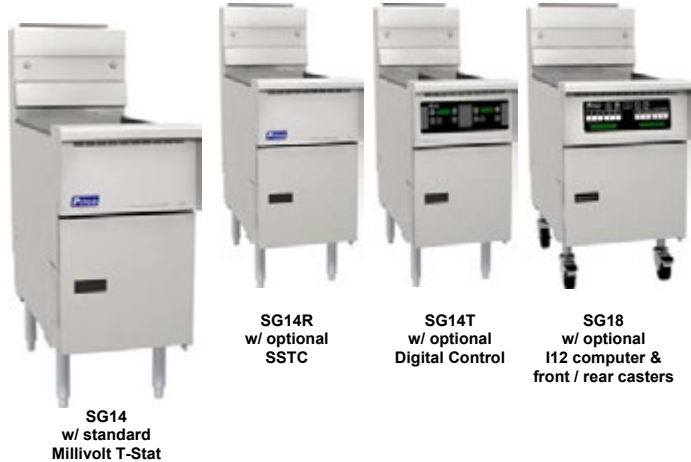
SG14 w/ standard Millivolt T-Stat

For High Production Gas frying specify Pitco Solstice Gas Models SG14, 14R, 14T or SG18 tube fryers with the patented Solstice Burner Technology. The dependable blower free atmospheric heating system provides fast recovery to cook a variety of food products. The Solstice gas fryer comes standard with a millivolt thermostat, for melt cycle and boil mode choose the optional quick responding solid state thermostat with the matchless ignition system. The optional digital control and the elastic time computer are available and can be used with our optional labor saving highly reliable basket lift system. The patented self cleaning burner and down draft protection keeps your fryer tuned up for peak daily performance.