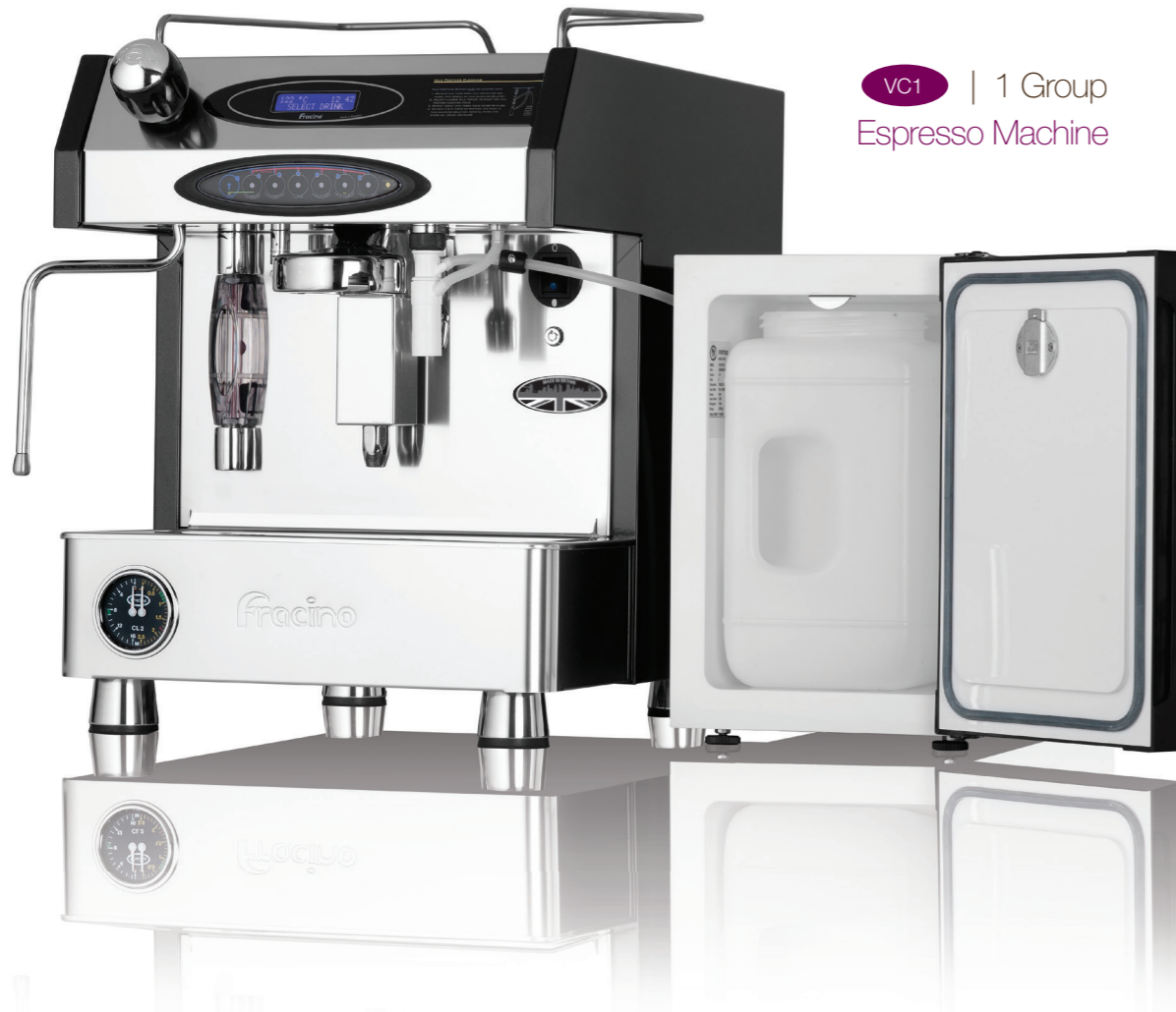
VC1 | 1 Group Espresso Machine

Introducing, the Velocino by Fracino, the state of the art hybrid espresso machine which pairs the convenience of a bean to cup machine, with the simplicity of a traditional espresso machine. Manufactured from the highest quality stainless steel, brass and copper components, it is a reliable and simple to maintain espresso machine, built to last a life time. This no nonsense new innovation has been specifically designed for sites with a high staff turnover, ensuring consistent, premium quality drinks each time, no matter how inexperienced the operator is. Combining the traditional E61 style chrome plated brass group with an automatic milk frother, advanced programming and an easy to understand control panel, the Velocino allows you to dispense all espresso based drinks straight into the cup at the press of a button.