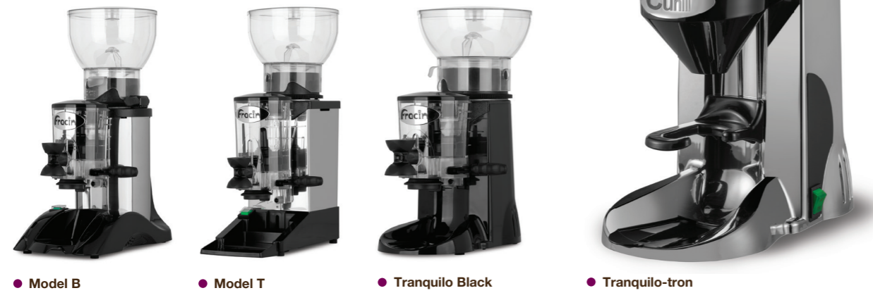
● Model B ● Model T ● Tranquilo Black ● Tranquilo-tron

The models T and B grinders have polished stainless steel cases and are ideally suited to the Fracino range of espresso coffee machines. The models T, B and Tranquilo grinders are operated manually by an on/off switch. All grinders have adjustable grinding blades and coffee portion control. Coffee is dispensed into the filter holders by means of a flick lever mechanism. The Tranquilo grinder is also available in a chrome option and as a single shot grinder for the freshest coffee. A tamper would be required for this option.