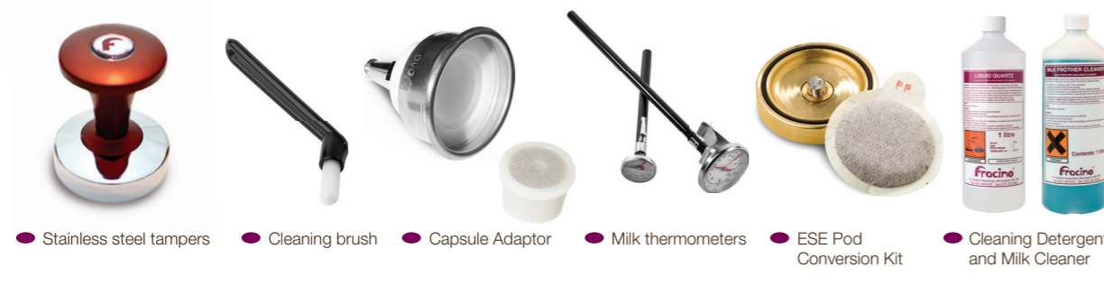
● Stainless steel tampers ● Cleaning brush ● Capsule Adaptor ● Milk thermometers ● ESE Pod Conversion Kit ● Cleaning Detergent and Milk Cleaner