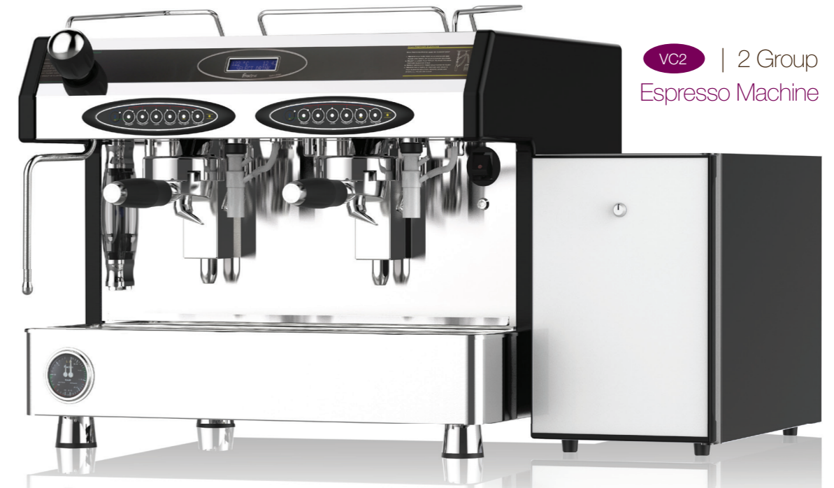
VC2 | 2 Group Espresso Machine