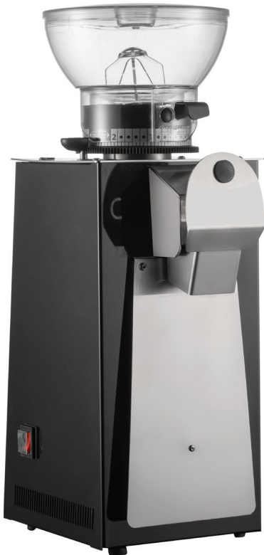
● Deli High Volume

The free standing and wall mounted dispensers have adjustable portion control for pre-ground coffee. Fracino's unique free standing chocolate dispenser is designed to accurately and efficiently measure directly into the cup or glass. The stand is made from highly polished stainless steel and the dispenser has a stylish chrome finish.