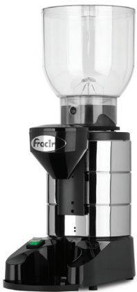
● Deli Low Volume

The Deli grinders are suitable for grinding all blends of coffee to be retailed by the bag and are available in three different sizes dependent on usage and volume. All models are suitable for espresso through to filter grind. The low volume deli grinder will grind 4 – 6 kilos per hour with a maximum running time of 20 minutes. The medium volume deli grinder will grind 6 – 10 kilos per hour with a maximum running time of 30 minutes. The high volume deli grinder is made entirely from stainless steel and has a unique vibration mechanism to ensure coffee settles into the bag. It will dispense between 10 and 15 kilos per hour with a maximum running time of 30 minutes.