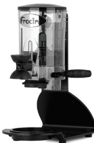
● Free Standing Dispenser