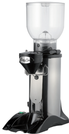
● Deli Medium Volume