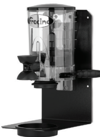
● Wall Mounted Dispenser

The free standing and wall mounted dispensers have adjustable portion control for pre-ground coffee. Fracino's unique free standing chocolate dispenser is designed to accurately and efficiently measure directly into the cup or glass. The stand is made from highly polished stainless steel and the dispenser has a stylish chrome finish.